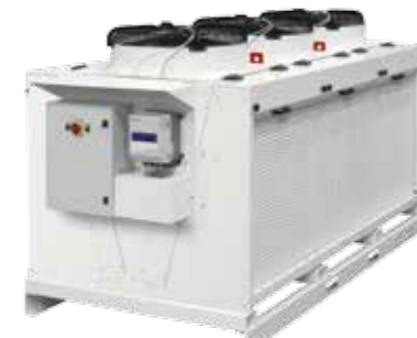
FLV Adiabatic liquid coolers