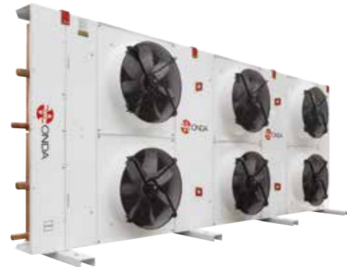
CND Condensers FND - PFND Dry-coolers