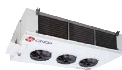
ED - AD Dual discharge air and unit coolers