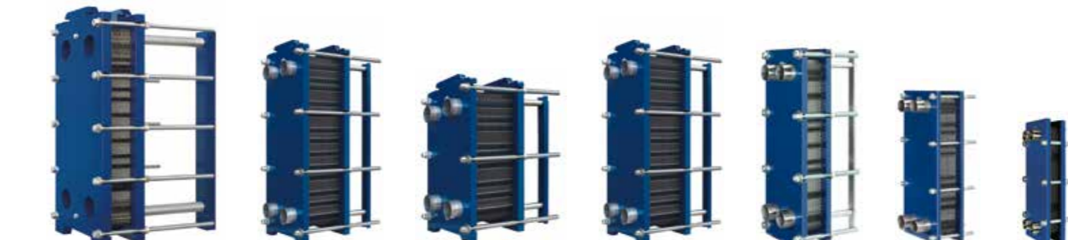
GG010 / GM010 GG009 GG008 GG007 GG006 GG005 GG003