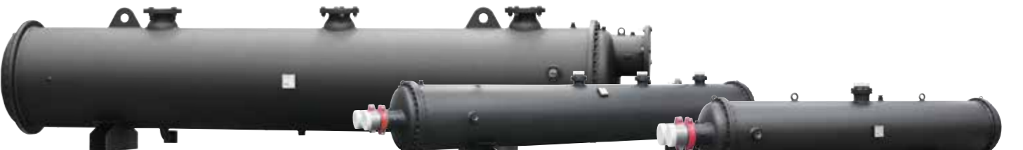
FLT - FLS Flooded evaporators