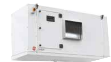
EC - AC Centrifugal air and unit coolers