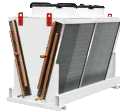
CLV Condensers FLV-PFLV Dry-coolers