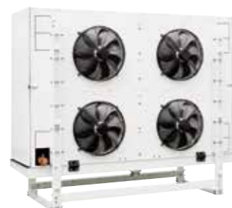
ET Blast Freezer