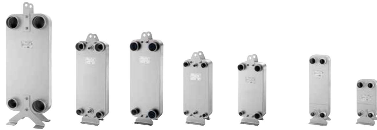
S606 - S606M S424 dual circuit S404 - S404M S222 dual circuit S202 - S202M S182 - S182M S101