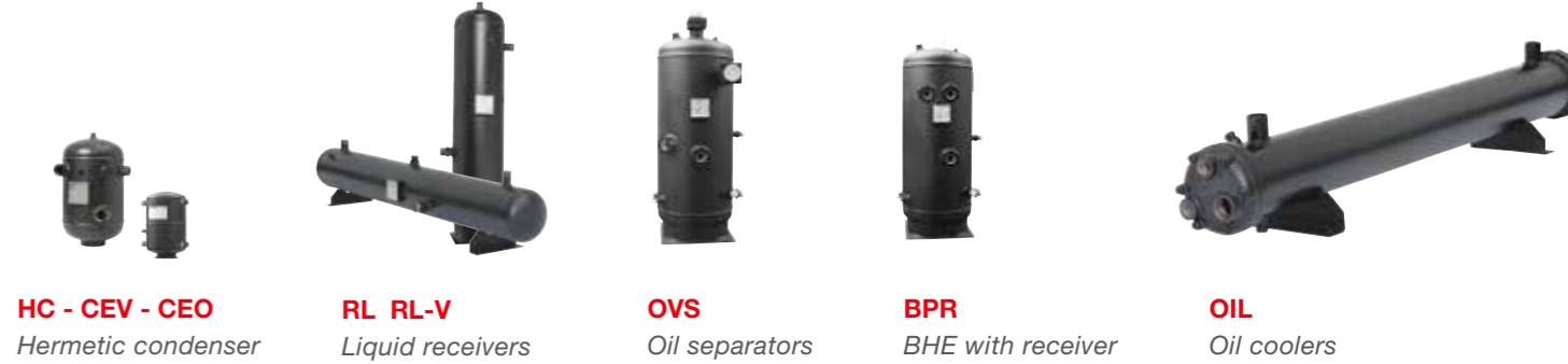
HC - CEV - CEO Hermetic condenser RL RL-V Liquid receivers OVS Oil separators BPR BHE with receiver OIL Oil coolers