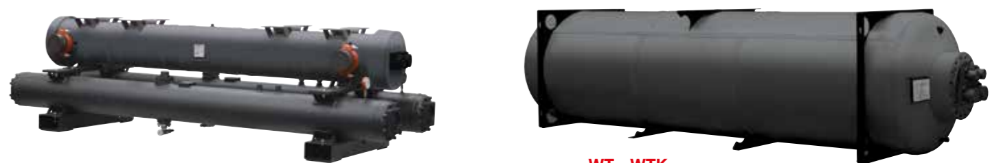
Modules (assembled evaporator & condensers) WT - WTK Water storage for evaporators