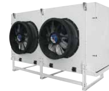
E - A Industrial air and unit coolers