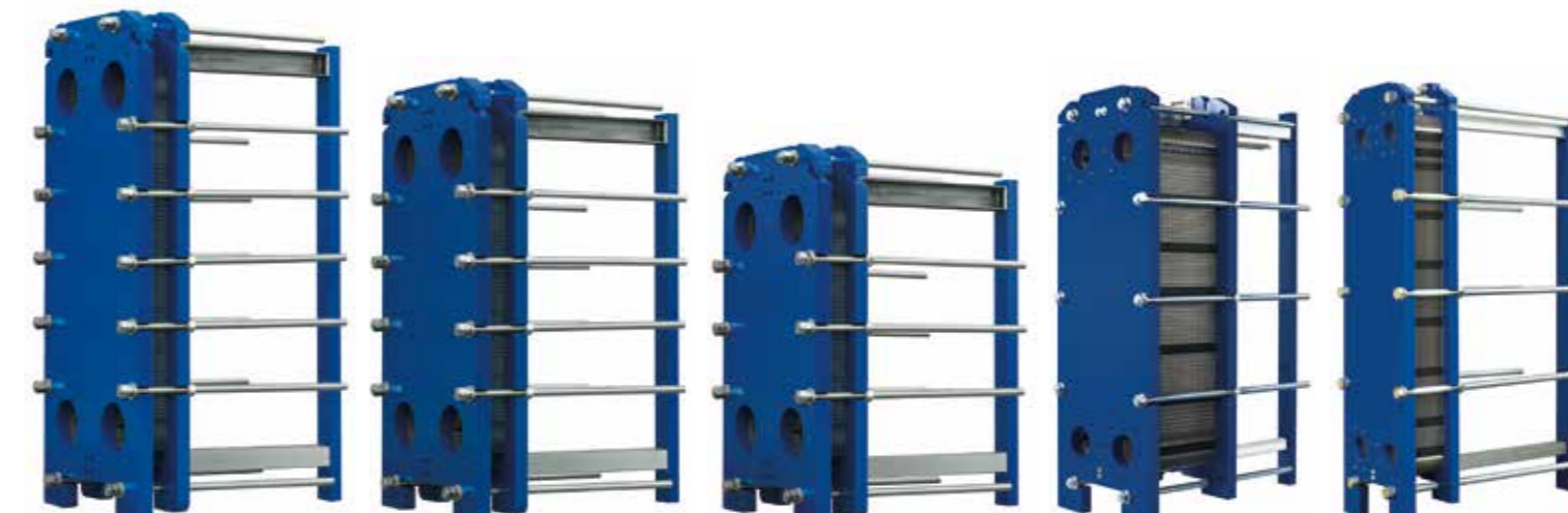
GT025 GT022 GT021 GT015 / GP015 GT012