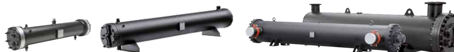
M - SM Sea water condenser C - L - R - B - HPC - LVC Shell & tube condensers LSE - SSE Straight tubes evaporators for New refrigerant low GWP MPE - LPE - HBE - HPE Shell & tube evaporators