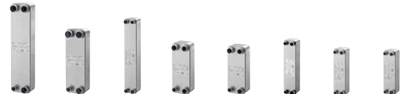
S82 - S82M S62 S22 S16 S12 - S12M S09 S07 S06