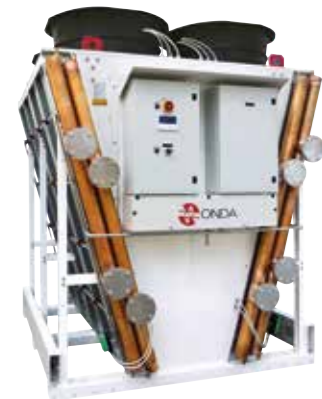
HVL-CVN Condensers MVL-FVN-PFVN Dry-coolers